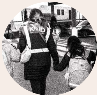
KIND staff work with children on the U.S.-Mexico border in 2022.

It is time to turn the page. We can begin by re-imagining the process for protecting unaccompanied children.